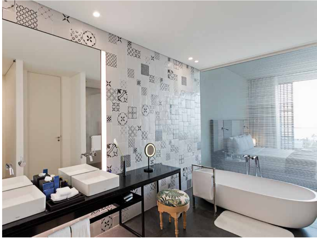
Each of the rooms at The Oberoi Beach Resort, Al Zorah has a private balcony. The villas and suites offer wide terraces and temperature controlled private pools.